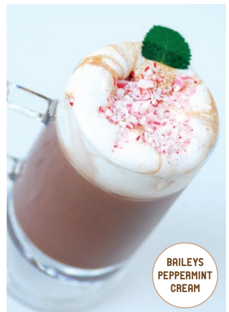
BAILEYS PEPPERMINT CREAM

Crush candy cane with the back of a spoon. Pour hot chocolate and Baileys