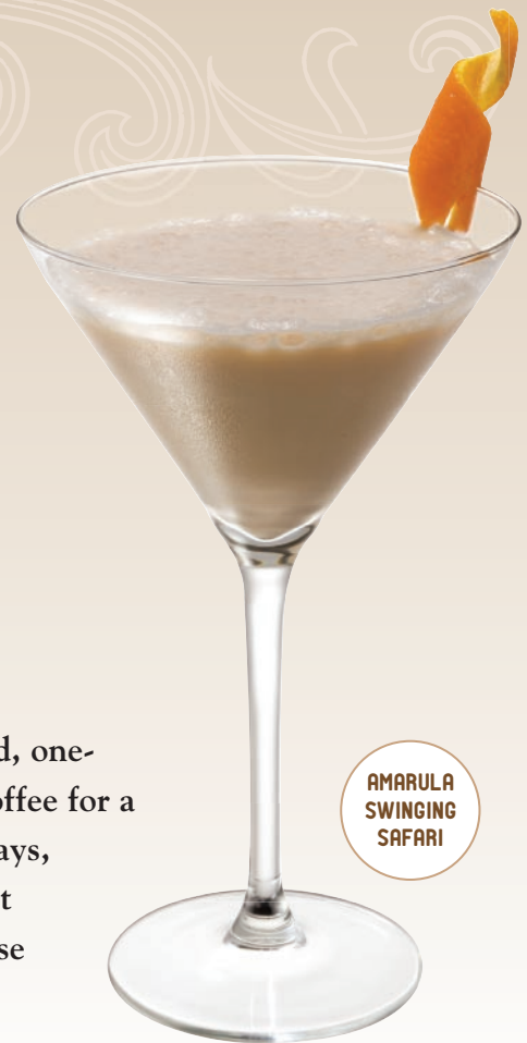
AMARULA SWINGING SAFARI

Mix equal parts honey and warm water. Stir until dissolved and place in a small bowl. Place crushed almonds onto a small plate. Dip the rim of a martini glass into honey water and then into crushed almonds. Pour Baileys, hazelnut liqueur, vanilla liqueur and half & half into a cocktail shaker with ice. Cover and shake well. Straining the ice, pour contents from shaker into rimmed martini glass.